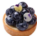
藍莓撻 Blueberry Tart