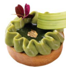
抹茶麻糬紅豆撻 Matcha Red Bean Mochi Tart