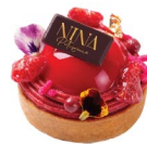
紅桑子開心果布丁撻 Raspberry Crème Brûlée Pistachio Tart