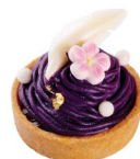
紫薯黑糖麻糬撻 Purple Sweet Potato with Brown Sugar Mochi Tart