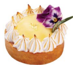
柚子蛋白霜撻 Yuzu Meringue Tart