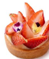
士多啤梨撻 Strawberry Tart