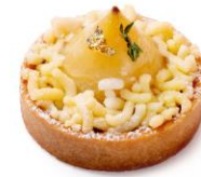
金寶蘋果香梨撻 Apple & Pear Crumble Tart