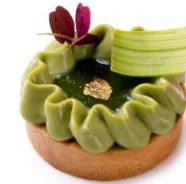
抹茶麻糬紅豆撻 Matcha Red Bean Mochi Tart