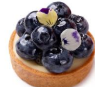
藍莓撻 Blueberry Tart