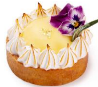
柚子蛋白霜撻 Yuzu Meringue Tart