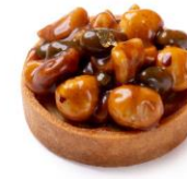
焦糖果仁撻 Caramel Mixed Nuts Tart