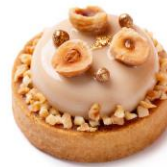
伯爵茶榛子撻 Earl Grey Hazelnut Tart