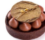
雙重朱古力撻 Double Chocolate Tart