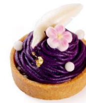
紫薯黑糖麻糬撻 Purple Sweet Potato with Brown Sugar Mochi Tart