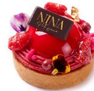
紅桑子開心果布丁撻 Raspberry Crème Brûlée Pistachio Tart