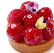
紅桑莓撻 Raspberry Tart